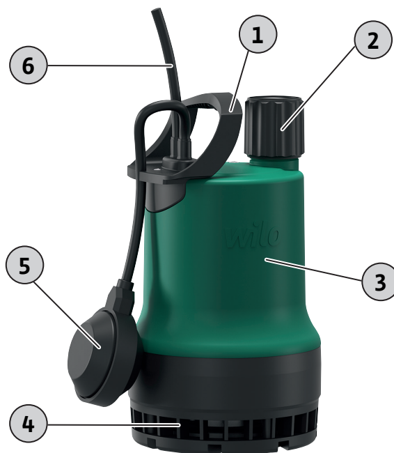
Fig. 1: Overview

Submersible pump for stationary and portable wet well installation. Pump with fitted float switch for fully automatic operation.